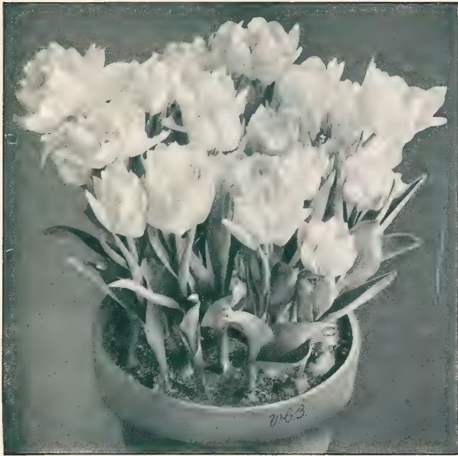
Double Early Tulips